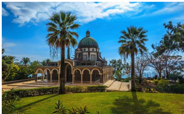
The Mount of Beatitudes

This morning will be at free to enjoy the hotel's facilities and take a swim in the Dead Sea. Mid-morning we will depart for Amman, the capital of Jordan. Amman is a city of wide streets, modern shops and spacious villas dotting the hills - all signs of growth; yet the entire area reflects a bygone civilization. A drive around the city takes us to the impressive Roman amphitheater which once accommodated 6,000 spectators and the hilltop Citadel. We will then depart Amman and drive north to Jerash which was founded by the soldiers of Alexander the Great in 300 B.C. Jerash now stands as the best preserved ruins of a provincial Greco-Roman city in the world. Along a 2-mile stretch we'll see the oval shaped forum encircled by 56 graceful Roman columns, Hadrian's Arch, the Temples of Artemis and Zeus, and the massive Roman theater. Continue to the Sheikh Hussein Bridge and cross into Israel. Transfer to our hotel in Galilee.