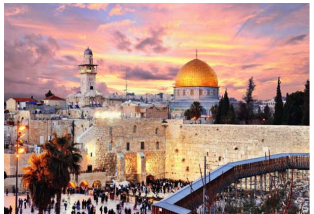
The Old City of Jerusalem

After an early morning Mass at the Church of the Holy Sepulchre we will return to our hotel for breakfast. Then later in the morning we will visit the Temple Area of the Old City featuring the Dome of the Rock, Mosque el Aqsa, and the Wailing Wall. Then enter the Old City of Jerusalem to visit the Church of St. Anne, the Pool of Bethesda, the Chapel of Flagellation, Lithostrotos, and the Arch of the "Ecce Homo". Follow the Via Dolorosa to the Church of the Holy Sepulchre to visit Golgotha and the Tomb of Our Lord. While at the Church of the Holy Sepulchre we will also have an opportunity to visit St. Vartan's Chapel (subject to permission). Continue to Mt. Zion to visit the Upper Room which is the site of the Last Supper, St. Peter in Gallicantu where Peter denied Jesus three times and the House of Caiphas and the famous steps where most archeologists agree that Jesus walked on the night of His arrest.