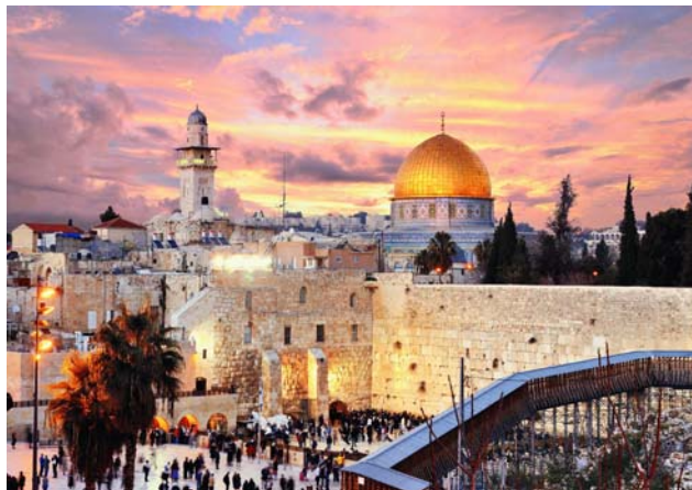
The Old City of Jerusalem

Church which was built by Constantine in the 4th Century above the traditional Grotto of Jesus' birth. Then tour the Grotto of St. Jerome, the Church of St. Catherine, and the Shepherd's Fields. After a brief visit at Bethlehem University we will return to Jerusalem. This evening enjoy a cocktail reception atop the Notre Dame Center with a beautiful view overlooking the Old City.